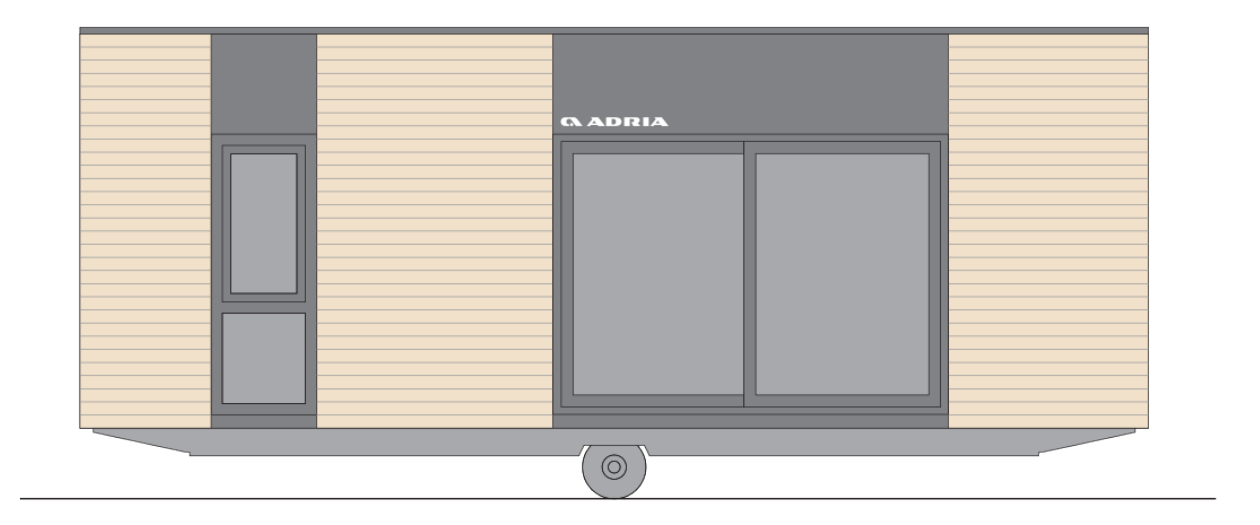
MLine 804 F22